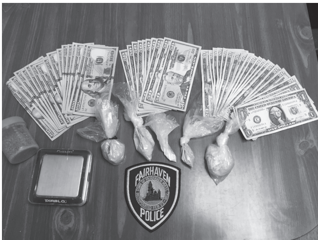
Heroin and cash seized during the December 15, 2015 drug raid.

We work hard to curb the distribution and abuse of illicit narcotics. This case is a tremendous victory for our department in our efforts to combat the flow of illegal drugs.