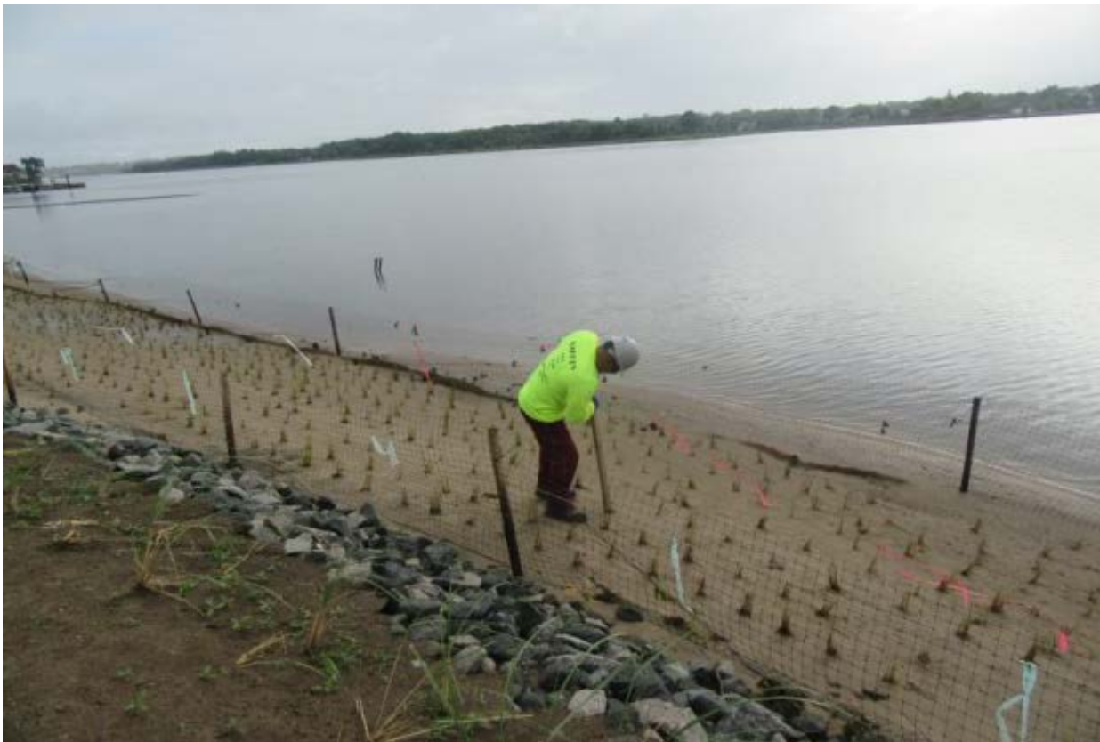
CAPTION: RESTORATION WORK AFTER SHORELINE CLEANUP NEARS COMPLETION BETWEEN COGGESHALL STREET AND THE END OF SAWYER STREET.