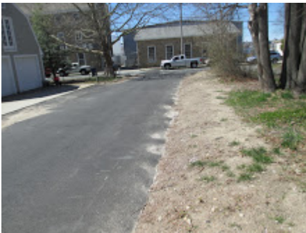
Reynold's Drive.JPG 5087K