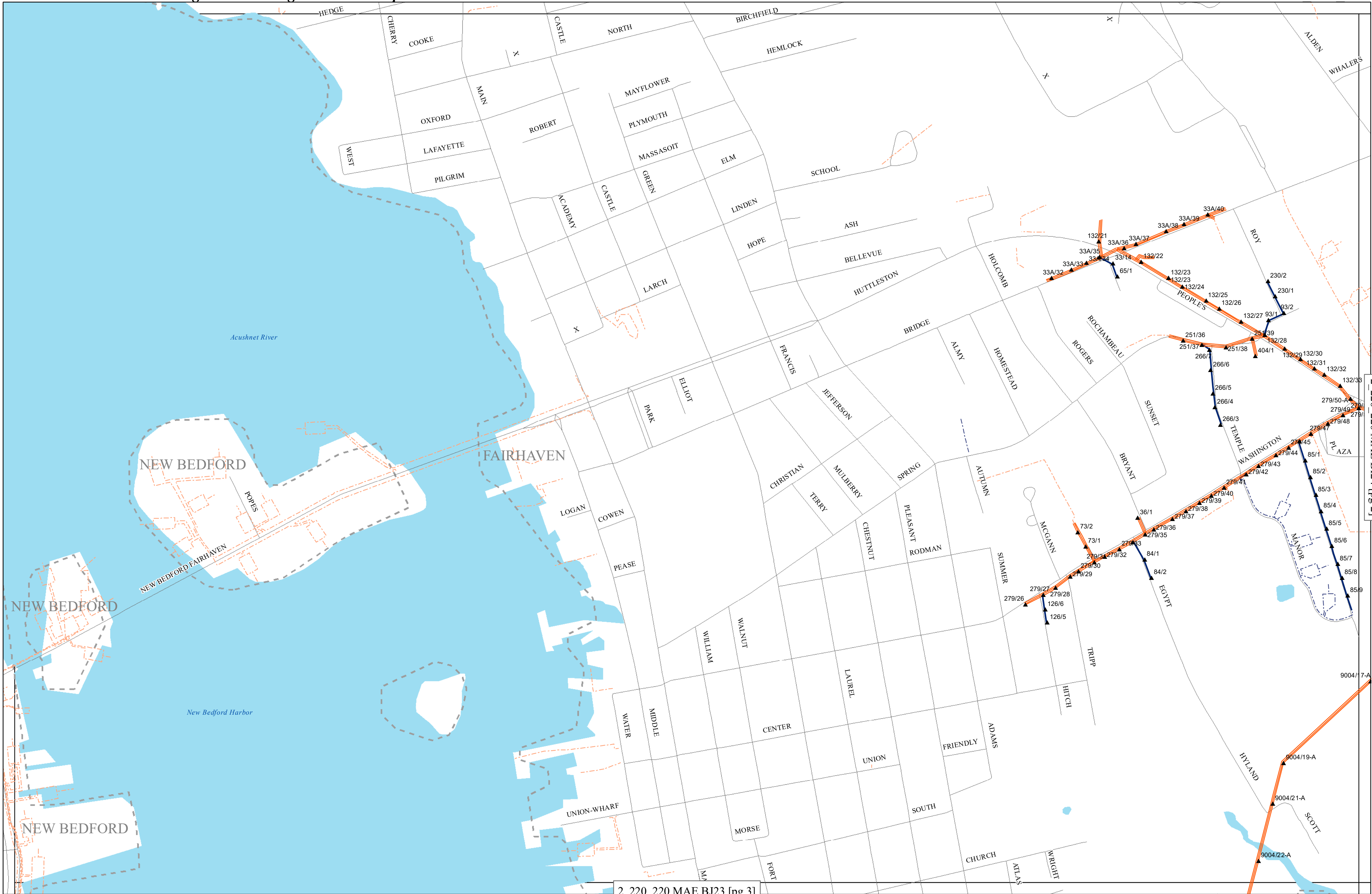
2_220_220 MAE BJ23 [pg 3]