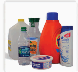
Kitchen, Laundry, Bath empty and replace cap