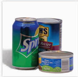
Aluminum and Tin Cans empty and rinse