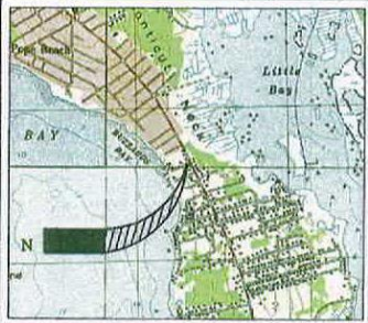
LOCUS MAP SCALE: 1"=2,000'±