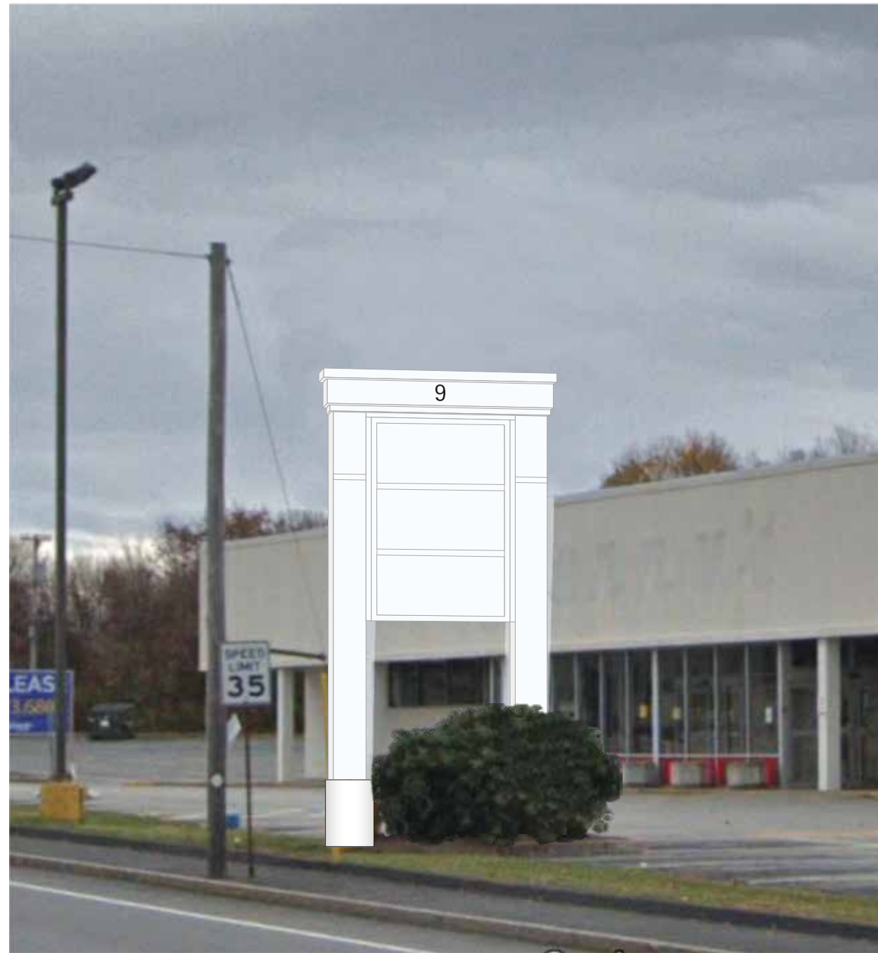
© Photo Comp - Proposed Not to Scale