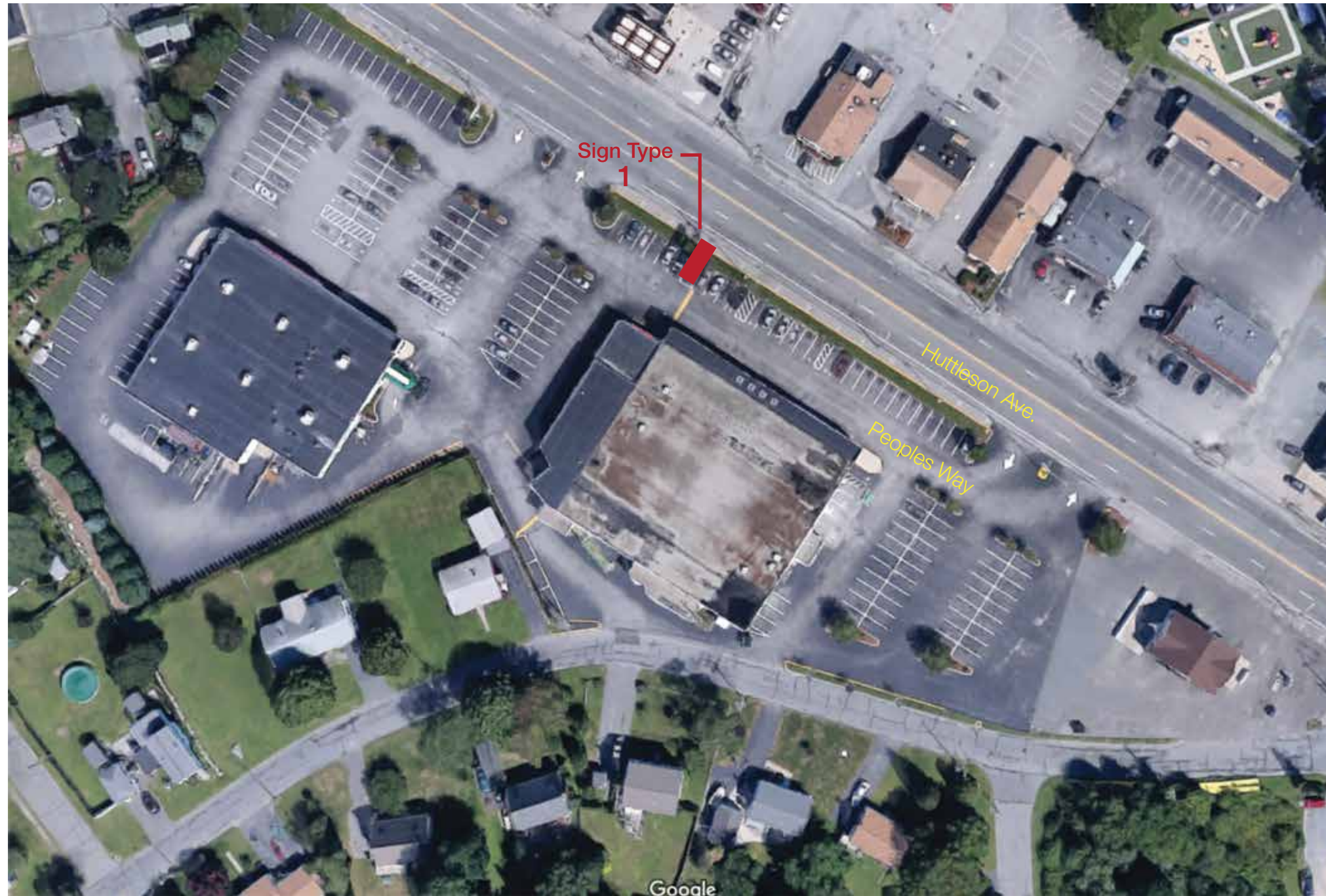
A Sign Location Plan Scale: Not to Scale