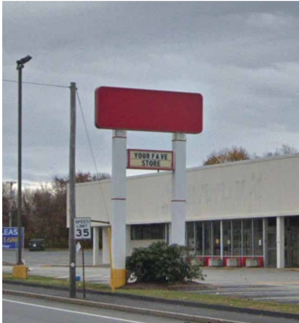
Existing Not to Scale