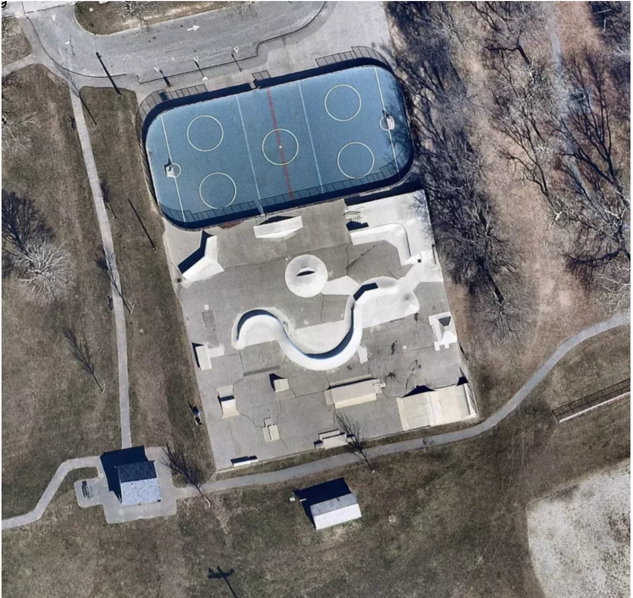
CPC FY14 Funded Phase 1- $60,000. Completed Dec. 2015