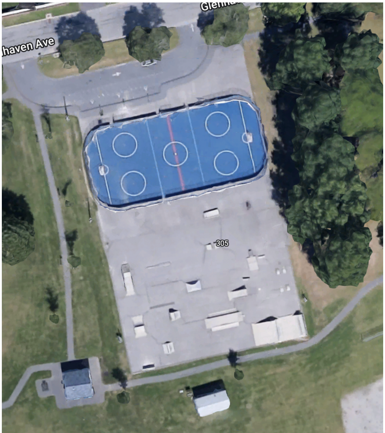
Livesey Skatepark 1999- Funded by North Fairhaven Improvement and Town Meeting article