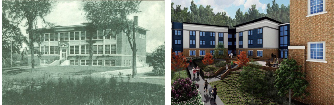
Historic Image of the Baldwinville School Building New Construction proposed addition.

Type: Mixed-Income Rental, Historic Preservation/New Construction Total Development Cost: Approximately $20 Million Total Units: 54 Projected Completion: 2026