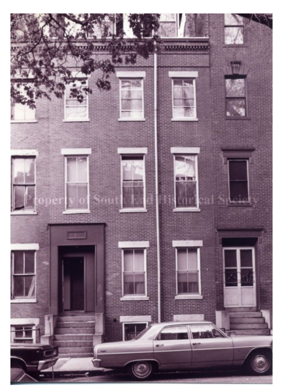
Historic Image of 34 East Springfield

Type: Mixed-Income Rental, Historic Preservation Total Development Cost: Approximately $3 Million Total Units: 5 Projected Completion: 2022