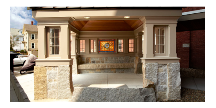
HISTORIC COMMISSIONS OVERVIEW davissquarearchitects.com

For the Bright Horizons Corporate office, we helped turn a civil war munitions depot into the headquarters of an expanding childcare corporation. The facility, which flouts conventional notions of corporate culture with its vibrant interplay of color, form, and unusual materials, was recognized for setting new standards of creativity in commercial interior design. At the Brunswick-Holborn & Columbia Wood Apartments, 11 historic buildings scattered throughout Boston were renovated into 94 units of housing. The project received an award from Environmental Design + Construction Magazine for its exemplary and creative application of environmentally, socially, and economically sustainable concepts. ■