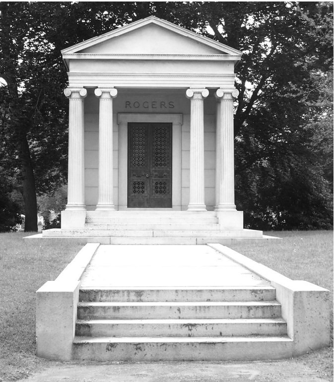
Henry H. Rogers mausoleum