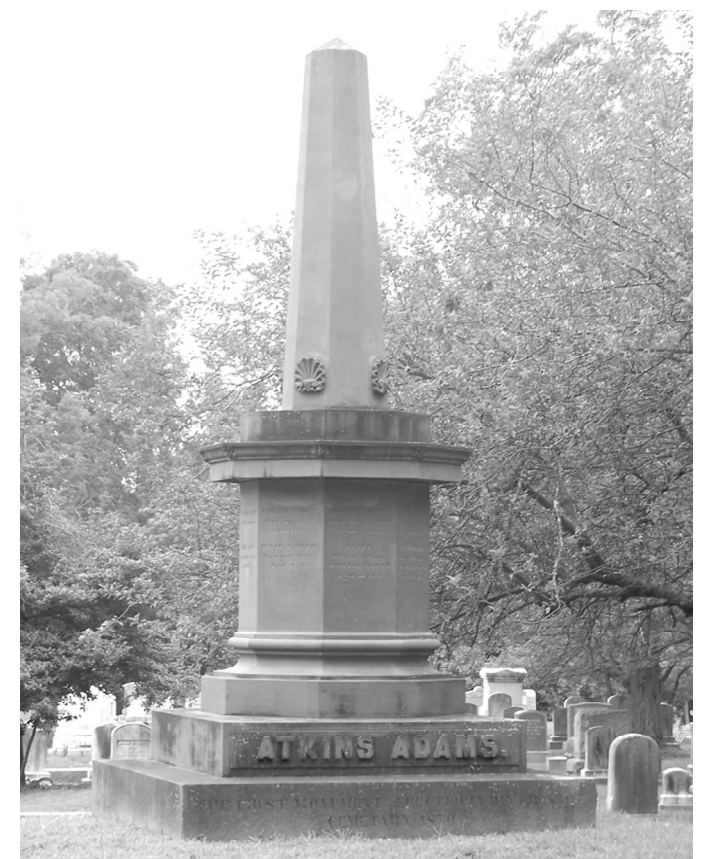
Riverside Cemetery's first monument