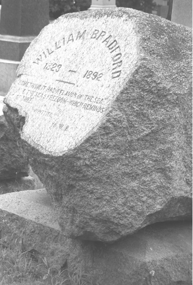
Grave of artist William Bradford