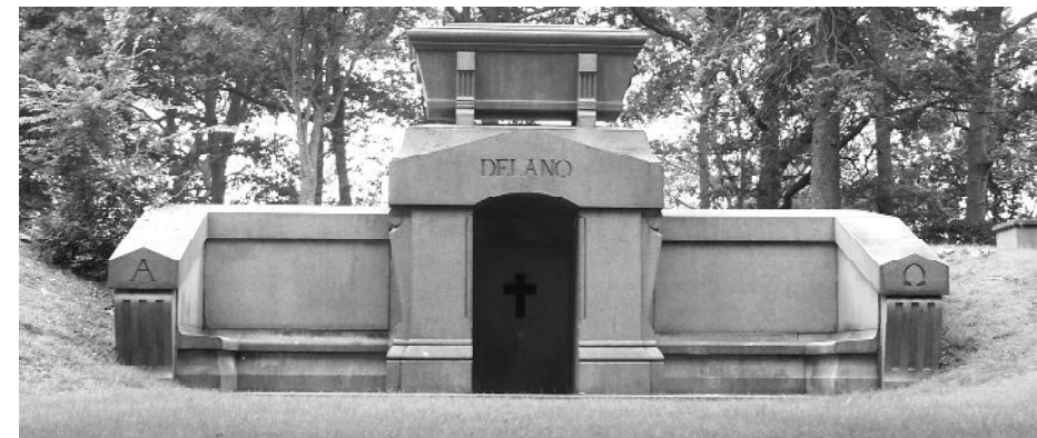
The Delano family tomb, designed by architect Richard Morris Hunt.