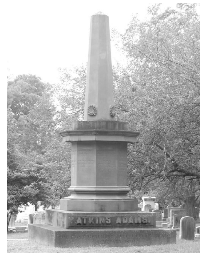
Riverside Cemetery's first monument