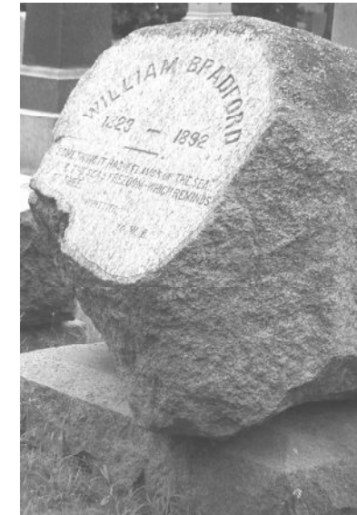
Grave of artist William Bradford

48. Holding Tomb . This tomb was used for temporary storage when burials were delayed because of frozen ground during the winter.