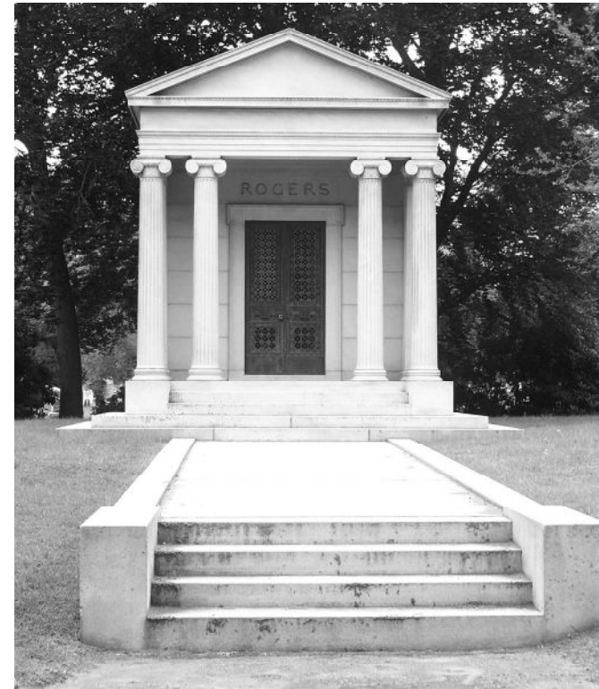
Henry H. Rogers mausoleum